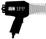
Hot Air Gun

HAG-110 110 volt Hot air gun for use on all low voltage products and most medium voltage accessories. Not recommended for MV. Splices HAG-220 220 volt Hot air gun for use on all low voltage products and most medium voltage accessories. Not recommended for MV. Splices