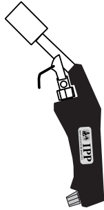
Self-igniting Propane-fired Torch